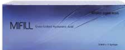
HYDRO SHINE PLUS